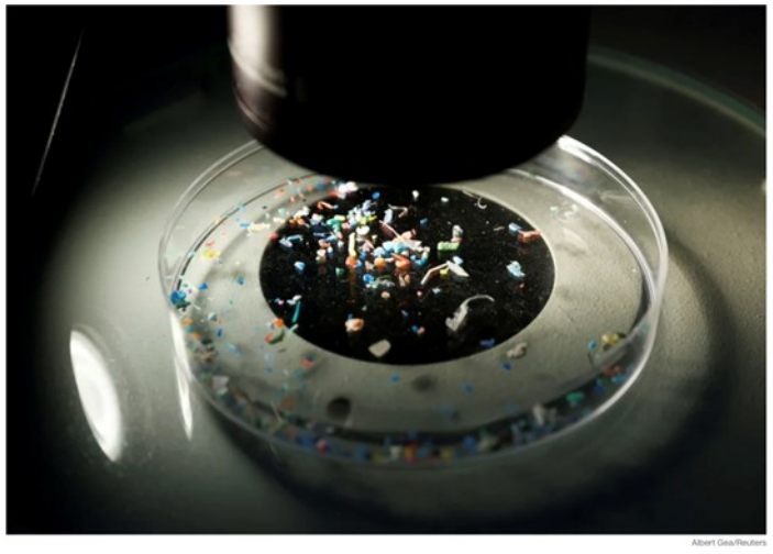
croplastics collected from the sea near Barcelona, Spain, are shown under a microscope on July 5, 2022.

play a role in cloud formation by tracing how the microplastics ended up at their final location.