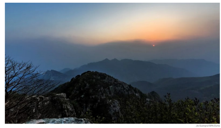
Sunset scenery at Mount Tai in Tai'an, east China's Shandong Province on May 23, 2018.

A new study published in the American Chemical Society's Environmental Science & Technology Letters reported that microplastics have been detected in a majority of cloud samples taken from a mountaintop in China. The study discovered that microplastics could